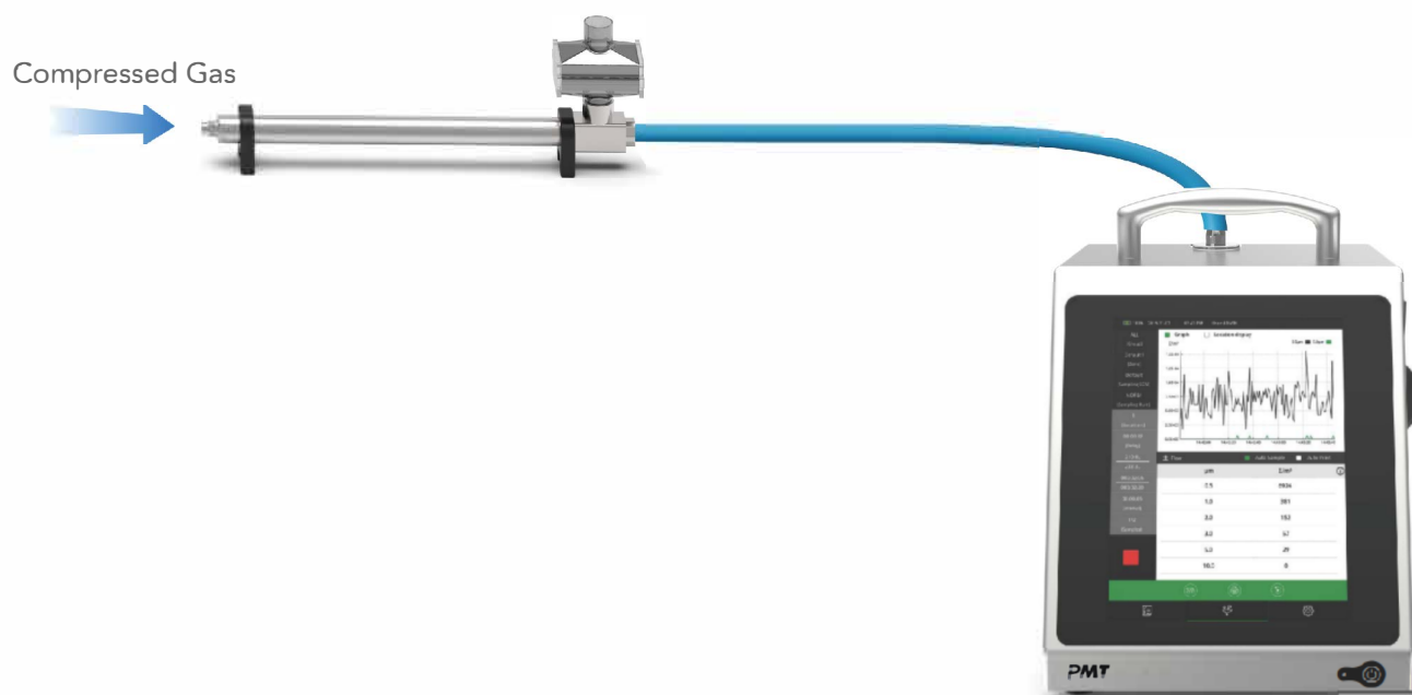
Application 1: Compressed gas particle detection

Compressed gas is decompressed to atmospheric pressure by the High Pressure Gas Diffuser and transported to the back-end sampling/detection device for sampling or detection.